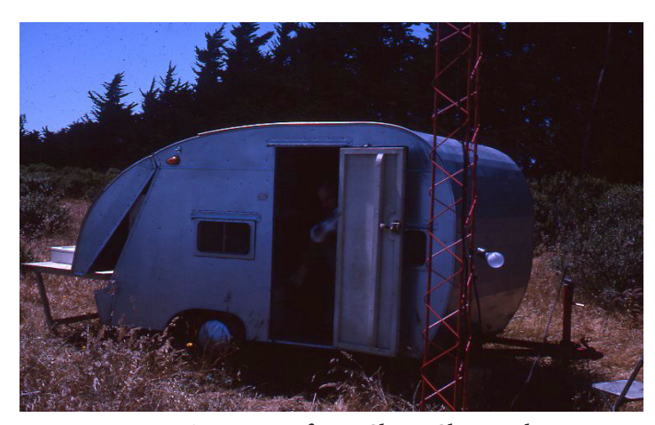
FIELD DAY 1963

Brian Torr, N6IIY Tel: (707) 575-5871 n6iiy@arrl.net