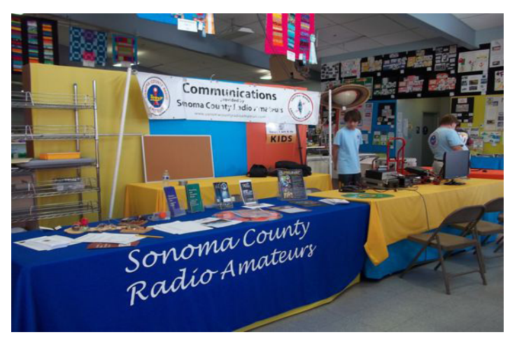
2014 SCIENCE FAIR AT SONOMA COUNTY FAIR GROUNDS

Check the Public Service page of the SCRA Website for more detail. <a href="http://sonomacountyradioamateurs.com/wp/events/public-service/">http://sonomacountyradioamateurs.com/wp/events/public-service/</a>