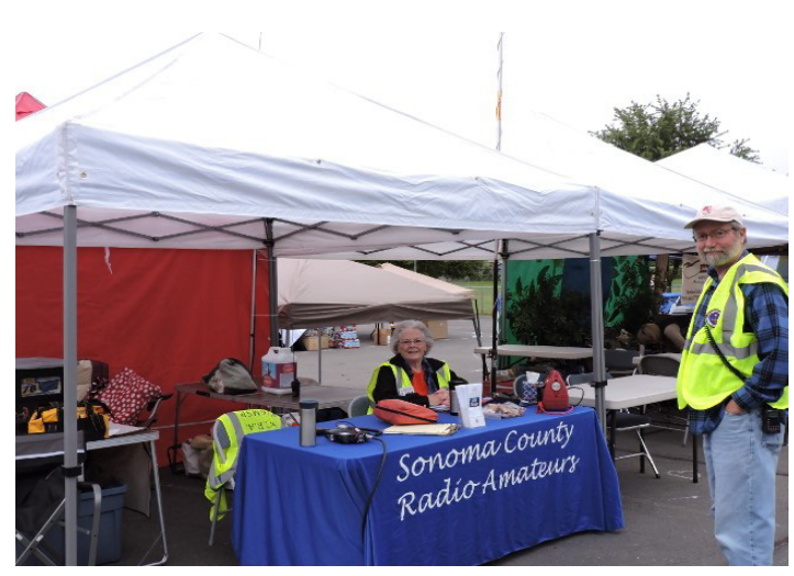
Human Race 2015